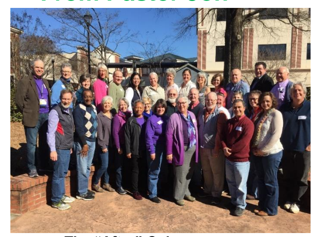
The "After" Column. (See last week for the "Before" column)

For bottom line people: The training went well and it was great hosting so many different people from the community here at University Lutheran. This past Friday evening 2/1 and Saturday 2/2 approximately thirty people from seven different local congregations and one organization gathered here at University Lutheran to discuss "The Clemson Pledge to End Racism" and to be trained on concrete behaviors we can take to combat racism. This program evolved from "The Birmingham Pledge", a pledge one individual created over twenty years ago to concretely address what he was going to do in his life with regards to