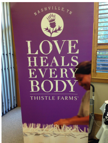
Thistle Farms banner

An amazing ministry story to share with you, once I'm back from Lutheridge.